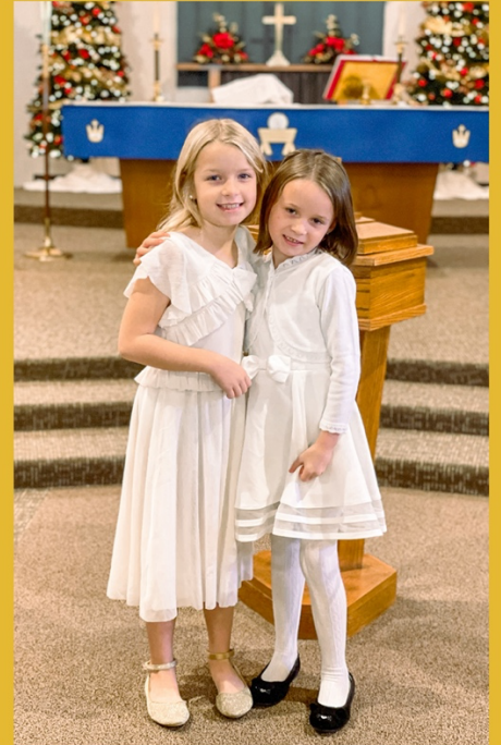
First Communion at Grace