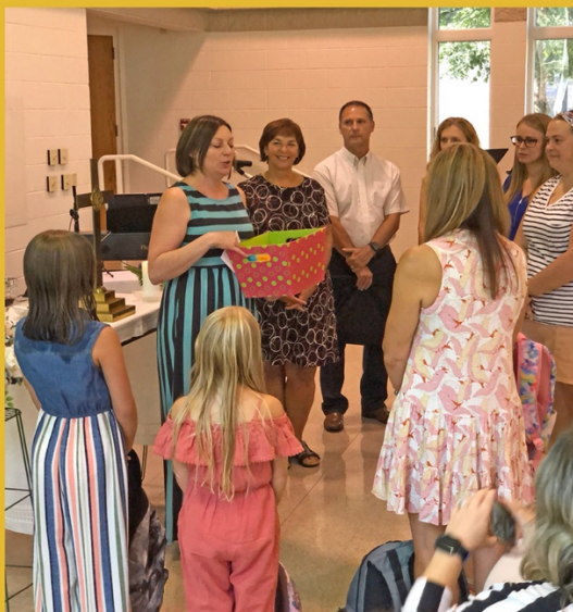
Blessing of the backpacks