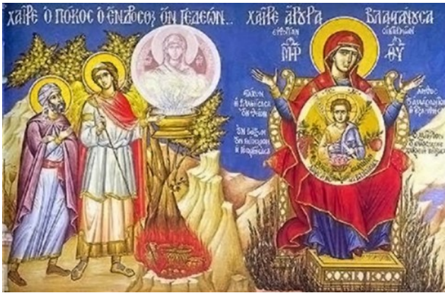
This Greek Orthodox icon celebrates the Judge Gideon and his exploits.

The Angel of the Lord. God used angels as messengers to deliver His calls to his chosen several times. Angels of the Lord appeared to Abraham and Moses. In the New Testament, Angels brought messages to Elizabeth and Mary, the mother of Jesus. When the Angel appeared to Gideon, he was terribly frightened because “I have seen the Angel of the Lord face to face” (v.6:22). But the Lord reassured him, “Peace! Do not be afraid” (v6:11).