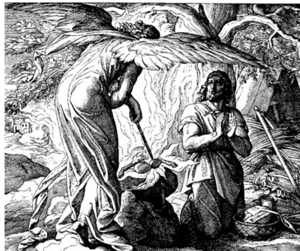
This 19th century woodcut shows Gideon receiving a sign that convinced him he was talking to God's

The succession of 15 Judges who succeeded Joshua included six so-called major Judges: Othniel, Ehud, Deborah (yes, there was a woman judge), Gideon, Jephthah, and Samson. Eli and Samuel were the last Judges before Saul, the first King. In this Bible study we will consider the Gideon story in Judges 6-8 to help us understand how God answers his people's calls to be rescued from oppression by calling Judges to lead their rescue from oppression.