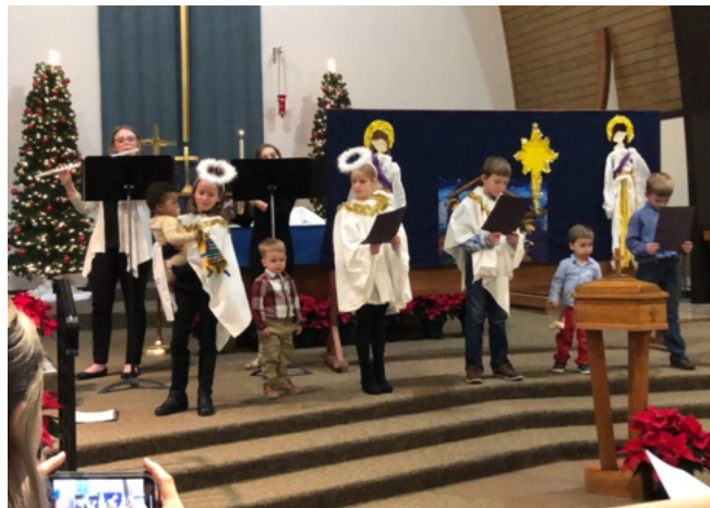
The youngest children in the Grace family joined in the last song of the Pageant.