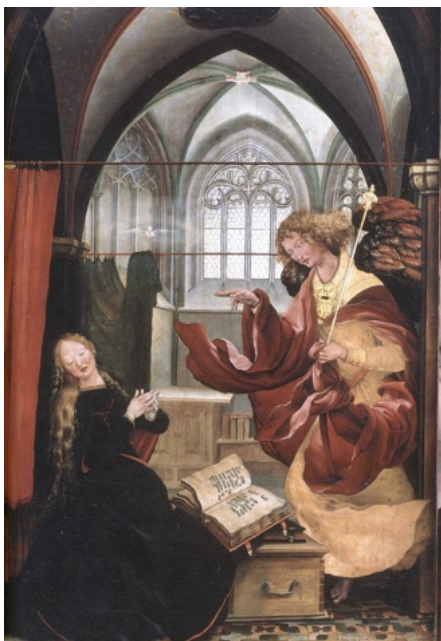
The Annunciation, from the rear panel of the Isenheim Altar (Colmar, France), by Matthias Grünewald (1512-1516).

THE VIRGIN. The young woman or maiden in this scripture is introduced as a " virgin ." Then we are told her name was " Mary ." She was young, probably just barely of child-bearing age (12 to 14). At that time, she was " betrothed " to Joseph but